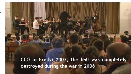
CCO in Eredvi 2007; the hall was completely destroyed during the war in 2008