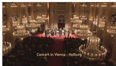
Concert in Vienna - Hofburg

Different Concert Tours have brought the orchestra to important Concert places in Europe, like "Konzerthaus Berlin", March 2006, "Hofburg Wien" September 2006 (invited by the OSCE), "Dôme des Invalides" Paris October 2007, "Grand Hall of Conservatory" Brussels October 2007.