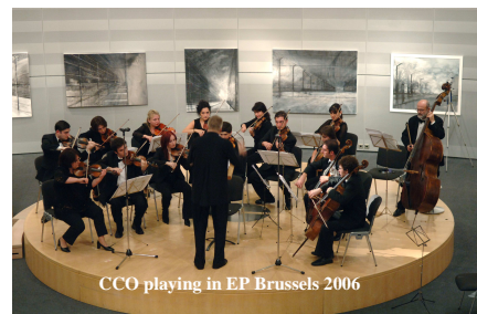
CCO playing in EP Brussels 2006

In November 2007 the Orchestra performed a very successful concert tour through Spain with 9 concerts. In October 2009 the Orchestra was invited again to Spain with 13 concerts.